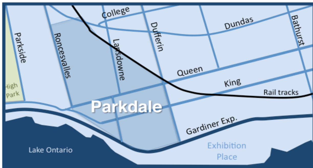
Figure 2: Map of Parkdale

Protecting affordability and community assets requires the entire community. It is an issue that affects everyone because it is ultimately about land – who has access to it, how it's developed, and who benefits from it. A community land trust (CLT) could give Parkdale greater control over development and managing change.